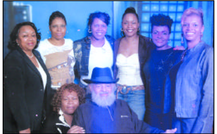
Some of the House of Jacob choir members at their first fundraiser event.

Q. How does David say such service (singing praises, rejoicing with song) is regarded by God?